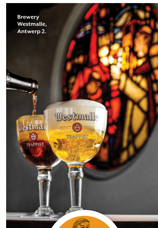
Brewery Westmalle, Antwerp 2.

The least commercialized of the Trappist breweries, visitors are only able to peek inside the church or buy the popular Rochefort 6, 8, or 10, or the new Triple Extra, at the abbey shop (there is