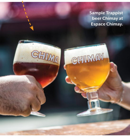
Sample Trappist beer Chimay at Espace Chimay.

Visitors to Belgium will soon notice that every beer is served in its own unique, branded glass. As I learned at Maison Leffe in Dinant, home of Abbey beer Leffe, the taste and experience of beer is partially determined by the shape of the glass. Trappist and Abbey ales are usually served in a chalice-shaped glass. Pouring the beer in directly creates a one-inch head that should exaggerate the fruity taste of the beer, and the wide opening allows for deep sips.