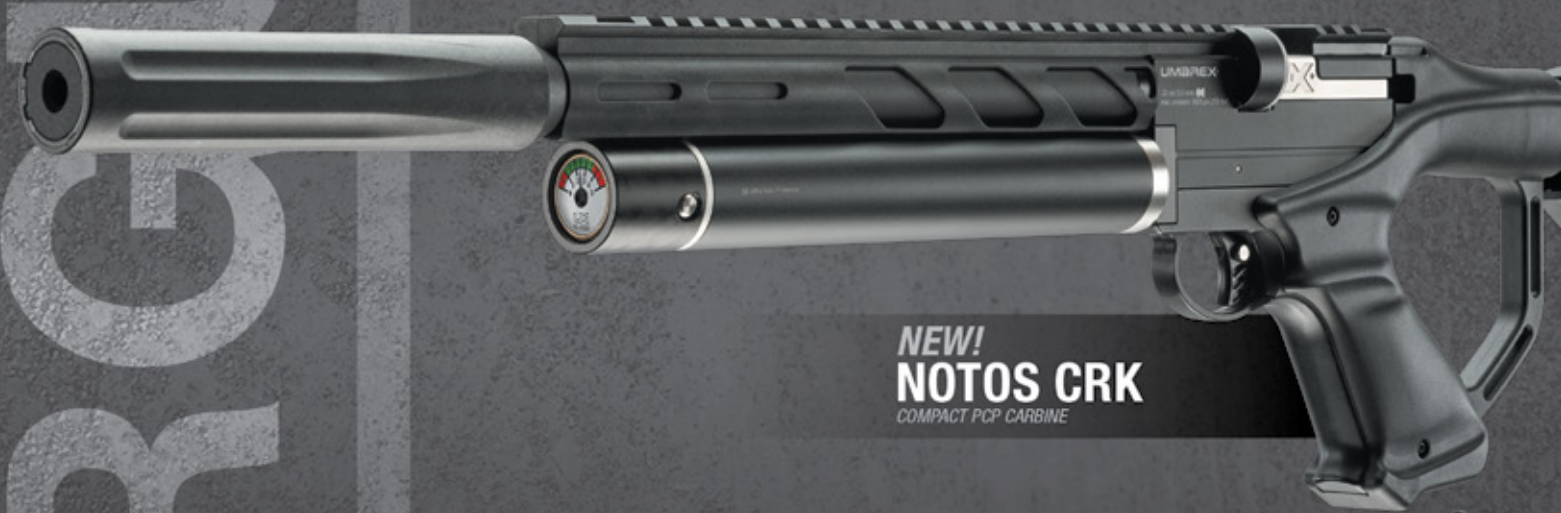
NEW! NOTOS CRK COMPACT PCP CARBINE