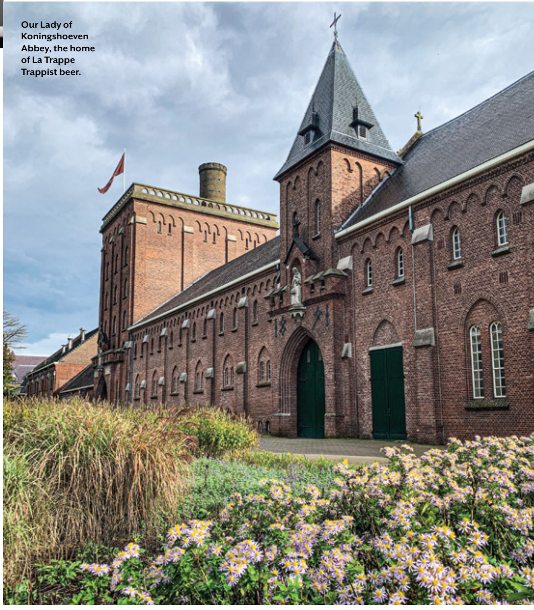
Our Lady of Koningshoeven Abbey, the home of La Trappe Trappist beer.

Between my first Trappist ale at Westmalle and my last at Westvleteren, it's fair to say I've reached beer enlightenment. Along the way, I've gained a respect for the traditions and way of life of the men behind the Trappist label. The "beer of work and prayer," as it's called at La Trappe Brewery, has rightfully become the Holy Grail of ales. &