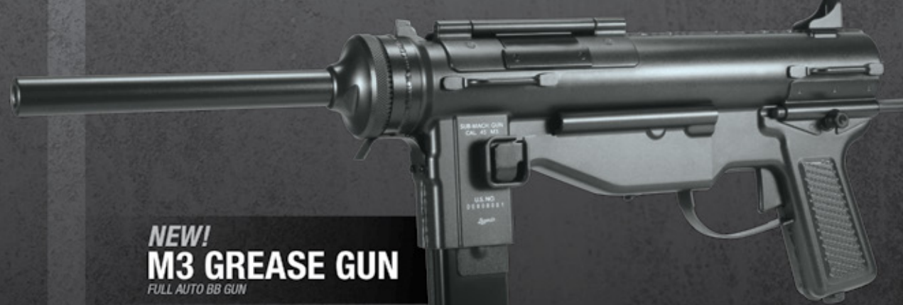
NEW! M3 GREASE GUN FULL AUTO BB GUN