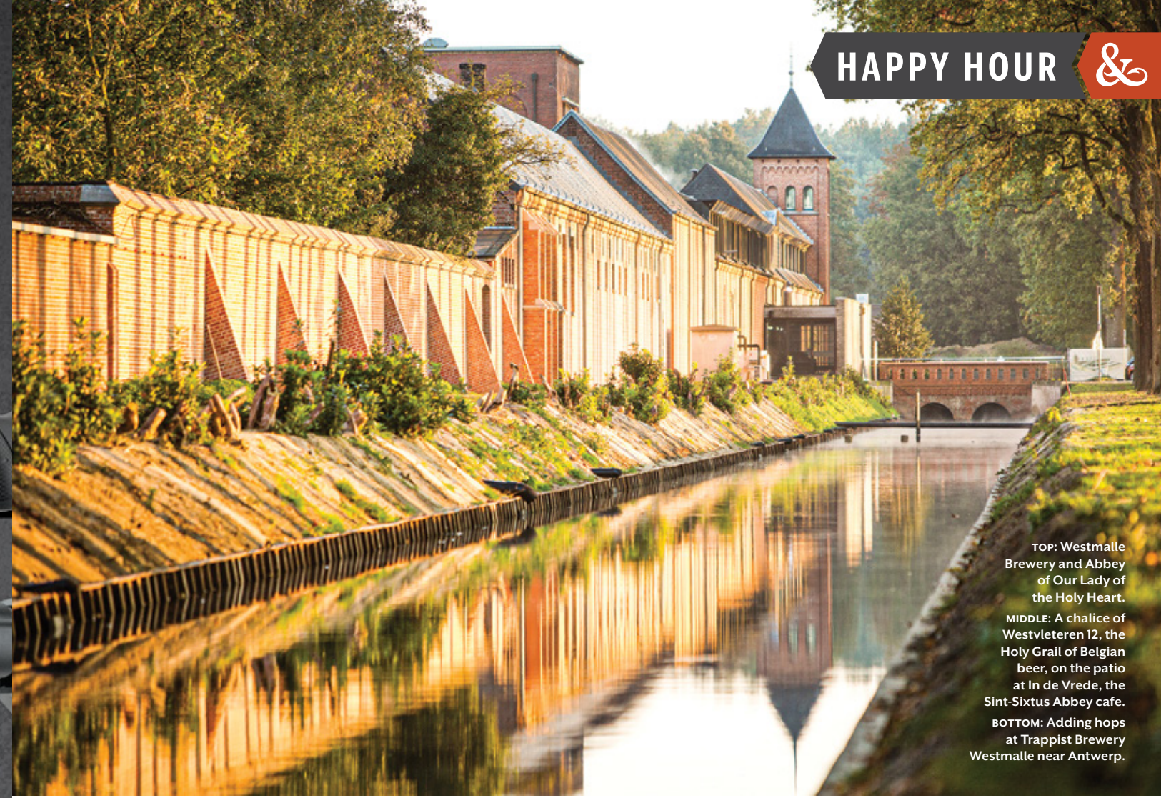
TOP: Westmalle Brewery and Abbey of Our Lady of the Holy Heart. MIDDLE: A chalice of Westvleteren 12, the Holy Grail of Belgian beer, on the patio at In de Vrede, the Sint-Sixtus Abbey cafe. BOTTOM: Adding hops at Trappist Brewery Westmalle near Antwerp.