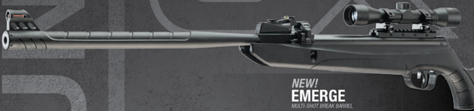
NEW! EMERGE MULTI-SHOT BREAK BARREL